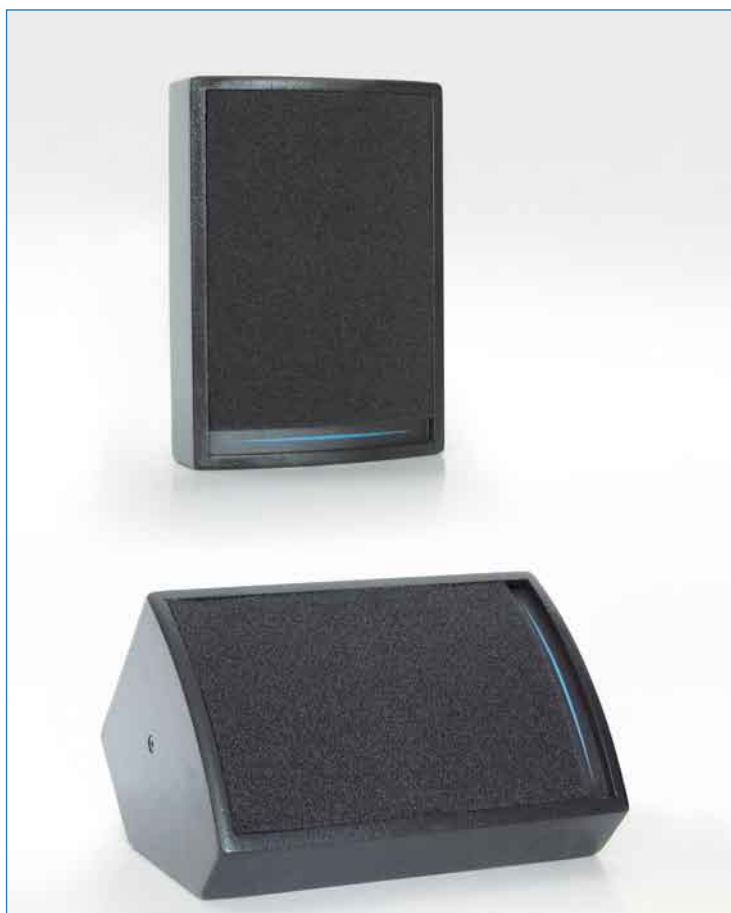
DS8 shown in FOH and stage monitor settings

APG recommends the following subwoofers : SUB138P/S, SUB238S or TB115S.